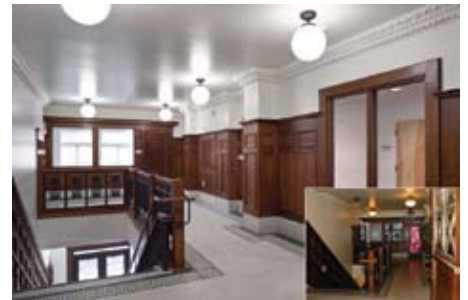
2nd floor lobby; grand stairs reopened