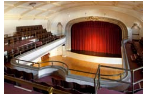
2nd floor auditorium with new shear wall