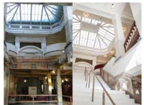
Reconstruction of grand stairs