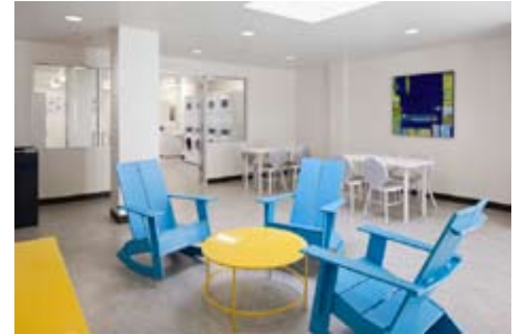
Tenant's laundry and lounge off roof deck