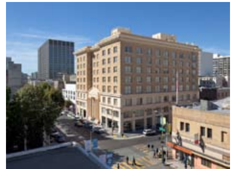
Modernized, converted mixed-use building