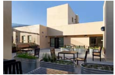
New 9th floor roof deck with planters

Angela Alioto, Chair of the San Francisco Ten Year Plan (To End Homelessness) Implementation Council and former Board of Supervisors President states: "I think the building is an absolute-dream come true. Only in San Francisco would a landmarked building of this kind of majesty be used to house 172 chronically homeless people. I think that speaks to who we are as a city. This project needs to be duplicated in every city in this nation. The level of dignity for the chronically homeless demonstrated in this building is unique in this nation."