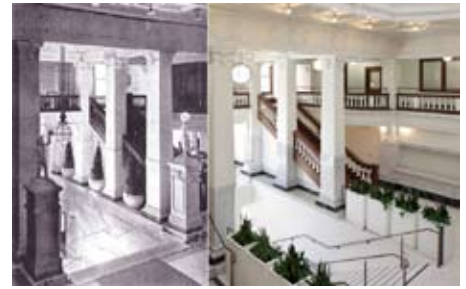
Grand stairs, 1910 (l) and 2013 (r)

However, Kelly Cullen Community (KCC) is not only beautiful – it will also provide vital services and housing for chronically homeless people coming from the streets of San Francisco. The ground floor clinic will be the Tenderloin's largest Department of Public Health Clinic; it will serve 25,000 visitors annually. Ultimately, Kelly Cullen Community will promote holistic well-being for San Francisco's most vulnerable, while reducing public spending on hospitalizations.