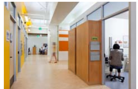
Ground floor: SF DPH's Tom Waddell Clinic