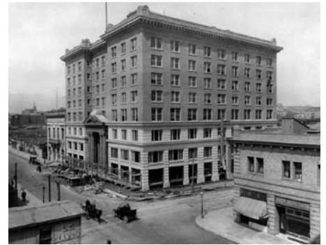
Central YMCA under construction, c.1910

In 2007, the Tenderloin Neighborhood Development Corporation (TNDC) acquired the building (now known as Kelly Cullen Community). Through a truly complex 5-year long process, TNDC's $95M rehabilitation provided extensive rehabilitation of the exterior, including repairs to the original windows as well as reconstruction of the main entry and ground floor storefronts that