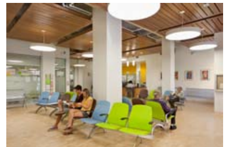
Ground floor: SF DPH's Tom Waddell Clinic